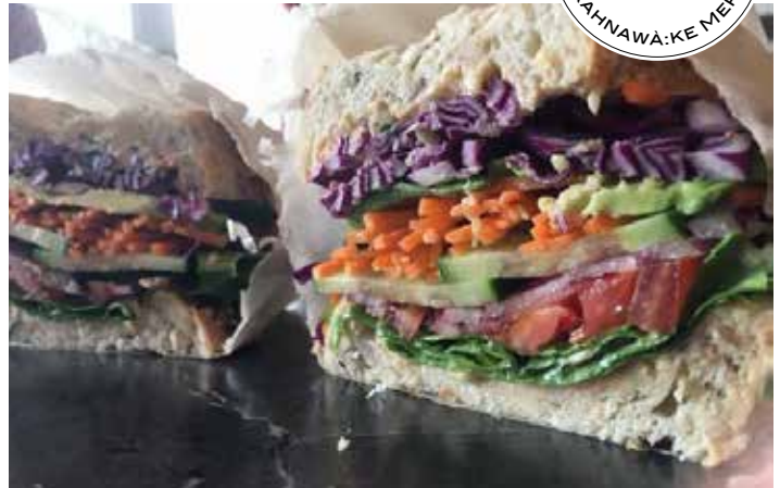
Good eats by Messy Kitchen catering.