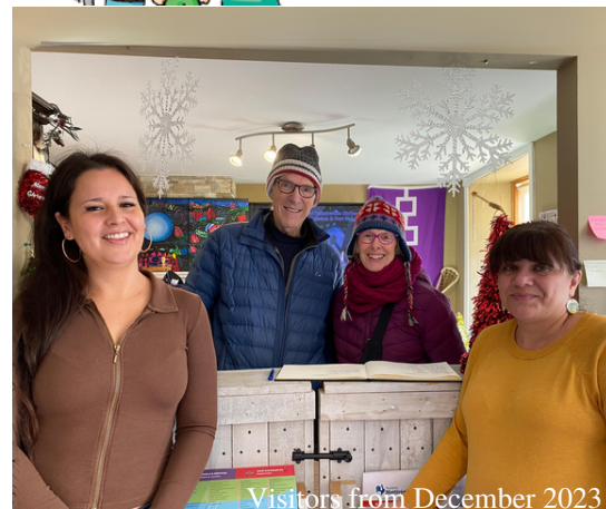
Visitors from December 2023