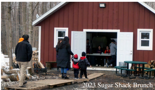
2023 Sugar Shack Brunch

In March 2023, partnering with Kahnawà:ke Survival School (KSS), the Maple Food Festival Sugar Shack Brunch hosted 256 people as a fundraiser for that year's graduating class.